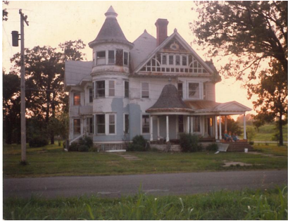
Mills House. 1986.