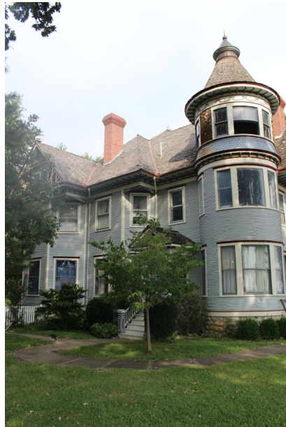
Mills House. 212 1st Street. South facade. 9-23-2015.