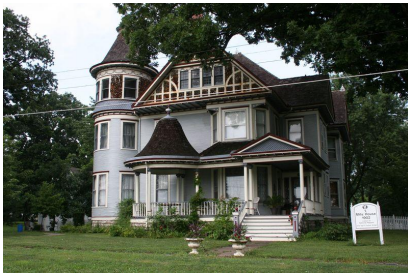
Mills House. 212 1st. East elevation. 2009.