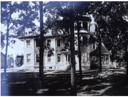
Mills House. 1927.