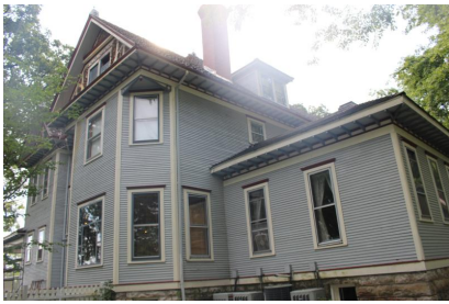
Mills House. 212 1st Street. North facade. 9-23-2015.