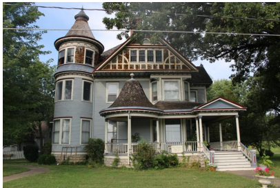
Mills House. 212 1st Street. East facade. 9-23-2015.