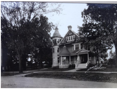
Mills House. 1927.