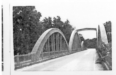
Pottawatomie Creek Bridge. n.d.

Pottawatomie Creek Bridge. National Register Nomination.