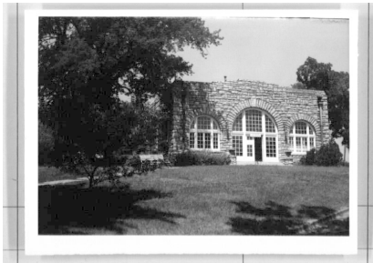
John Brown Cabin. 1973.