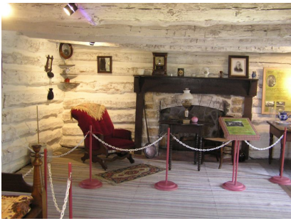
John Brown Cabin. Interior of cabin. 2007.