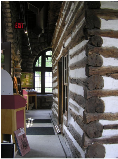
John Brown Cabin. View between cabin and 1928 stone structure. 2007.