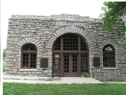
John Brown Cabin. Front facade. 2010.