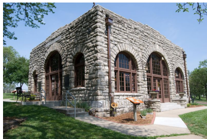
John Brown Cabin. 2008