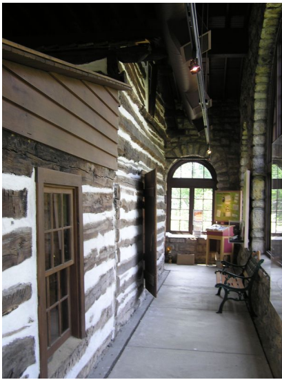
John Brown Cabin. View between cabin and 1928 stone structure. 2007.